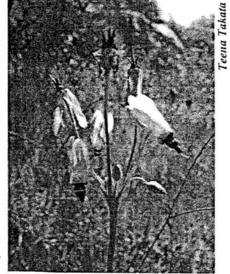
Padres' Shooting Star, Dayton Cyn. meadow

blooming. With its wide range of habitats, from coastal sage scrub to deserts to alpine meadows. California enjoys one of the most diverse and spectacular arrays of wildflowers from the state flower, the showy orange California poppy, to the blues of the wild lilac. Santa Barbara ceanothus.