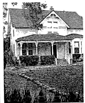
Strathearn Historical Park and Museum

SSMPA General Membership Program meetings take place every 3rd Monday of the months during the months of September through November and January through May. Program meetings begin at 7:15 p.m. and generally conclude by 9:00 p.m. The venue is the Rockpointe Clubhouse, 22300 Devonshire, Chatsworth, on the south side, 1 block Chatsworth Park South entrance.